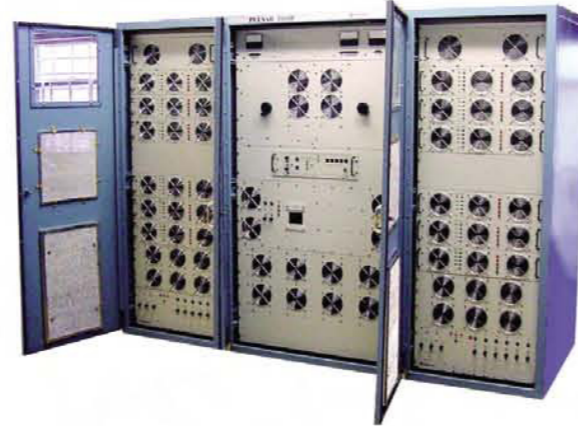
Pulsar 20,000 / 25,000