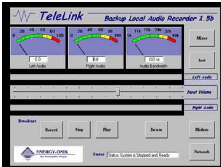
Backup Local Audio Recorder